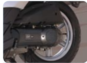
Four stroke, liquid cooled Euro 2 engine.