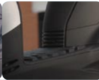
The flat platform makes Sportcity both practical and comfortable.