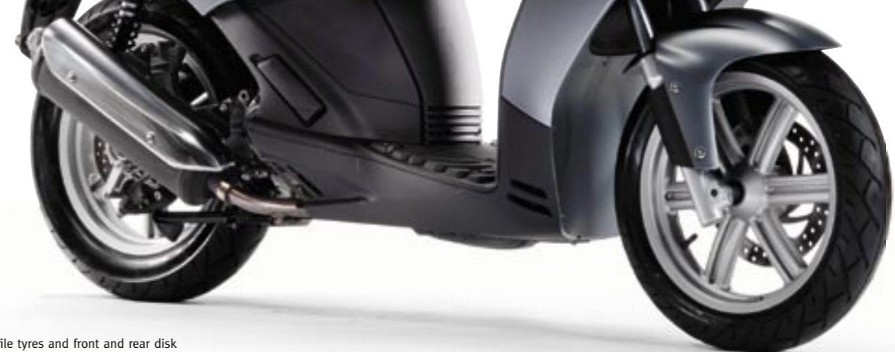
Low profile tyres and front and rear disk brakes guarantee superior comfort and safety.

On Sportcity, even the smallest detail has been designed to let you enjoy sports riding in total safety. The front and rear wheels are both large diameter 15" six spoke aluminium wheels and are fitted with wide profile tyres for superior road holding and agility. Disk brakes front and rear ensure instant, precision braking, and the 35 mm fork gives enhanced stability during braking and cornering.