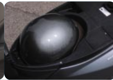
The spacious under-seat storage compartment provides plenty of room for a helmet and more besides.