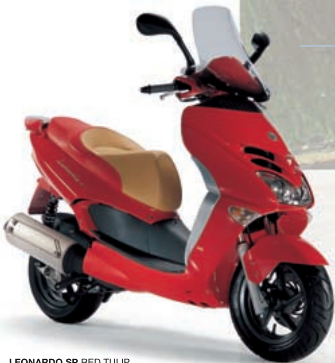
LEONARDO SP RED TULIP