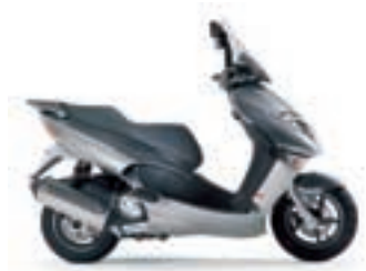
>> LEAD GREY