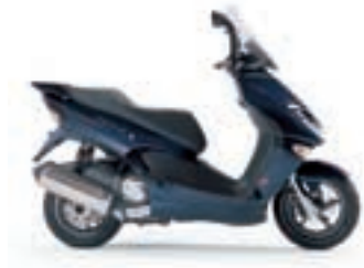
>> BLUE INFINITY