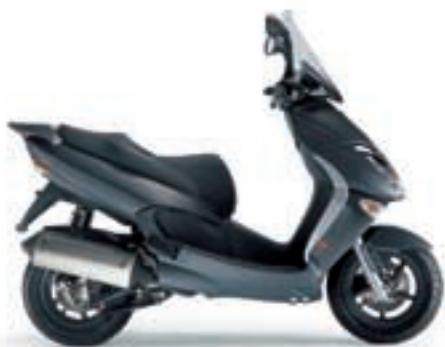
LEONARDO SP TITAN GREY